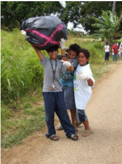
Children lend a hand to Clean Up Tonga

"Tonga has a problem with waste – people don't know what to do with their rubbish so it just ends up in our environment."