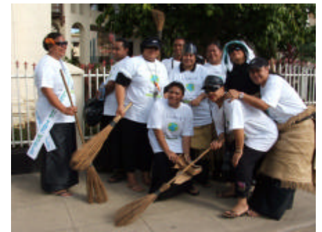
Prime Ministerial staff lending a hand on Clean Up the World Weekend

The initial landfill development was completed in January 2007 with extraordinary results and the team have now moved onto developing waste collection and transfer systems, and establishing recycling businesses and public awareness campaigns around the country.