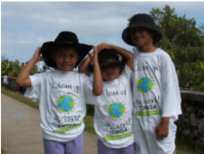
Tonga's youth helping out on the Clean Up the World Weekend

Poor waste management has become an issue of national concern for the South Pacific country of Tonga. In fact, a report recently conducted into the issue found that solid and liquid waste is the biggest environmental issue facing the country. (Priority Environmental Concerns, 2002)