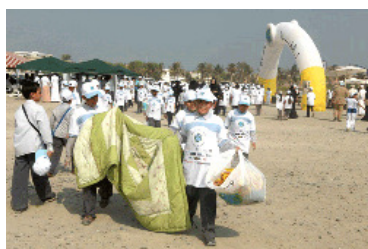
Students from government schools across the city take part in a clean-up drive at Al Mamzar area

Email | Print | Comment | Recommend this story (*) | [-]Text[+]